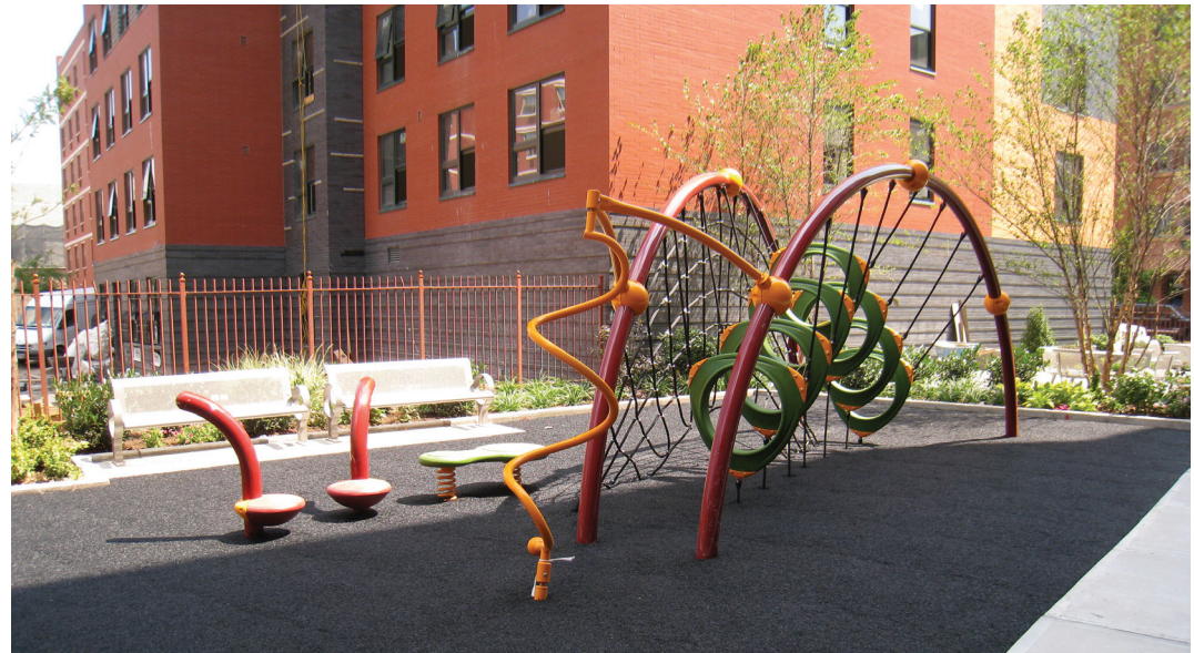
Outdoor Spaces: Playground and Common Green

Dunn addressed the role of architects and developers in designing and building quality and healthy permanent housing for the most vulnerable populations: homeless people with