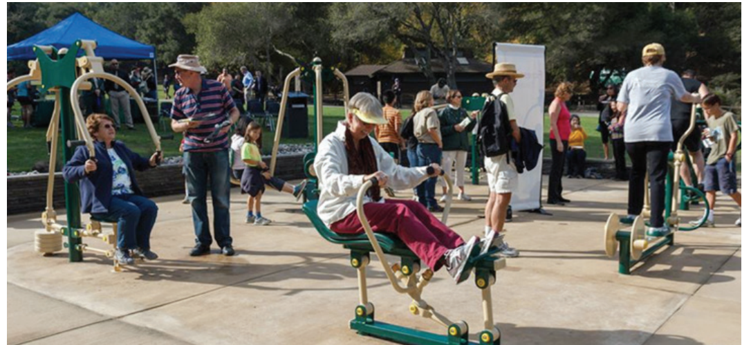
Adult Playground