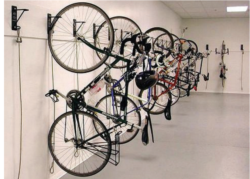
Active Transportation: Bicycle Storage in Existing Buildings Credit: Blue Sea Development Company (left); Gale's Industry Supply (right)