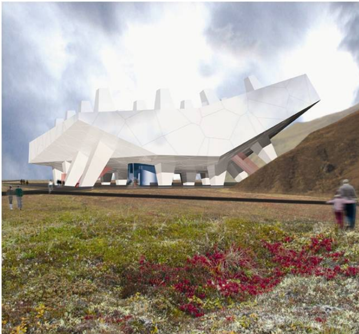
Leeser Architecture with Balmori Associates World Mammoth and Permafrost Museum Republic of Sakha-Yakutia (Yakutsk), Siberia