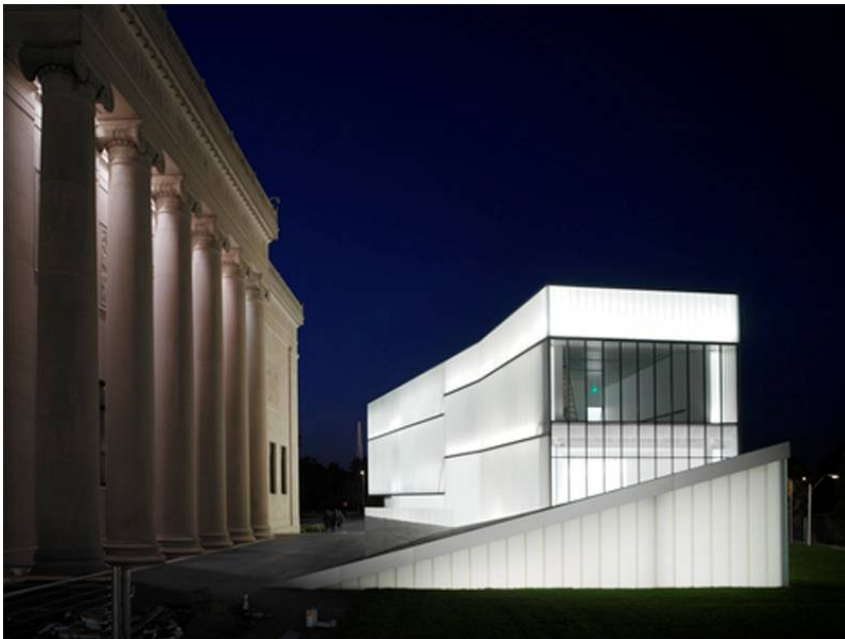
Steven Holl Architects The Nelson-Atkins Museum of Art Kansas City, MO