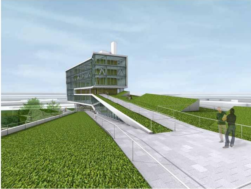
Toshiko Mori Architect The Syracuse Center of Excellence in Environmental and Energy Systems Syracuse, New York